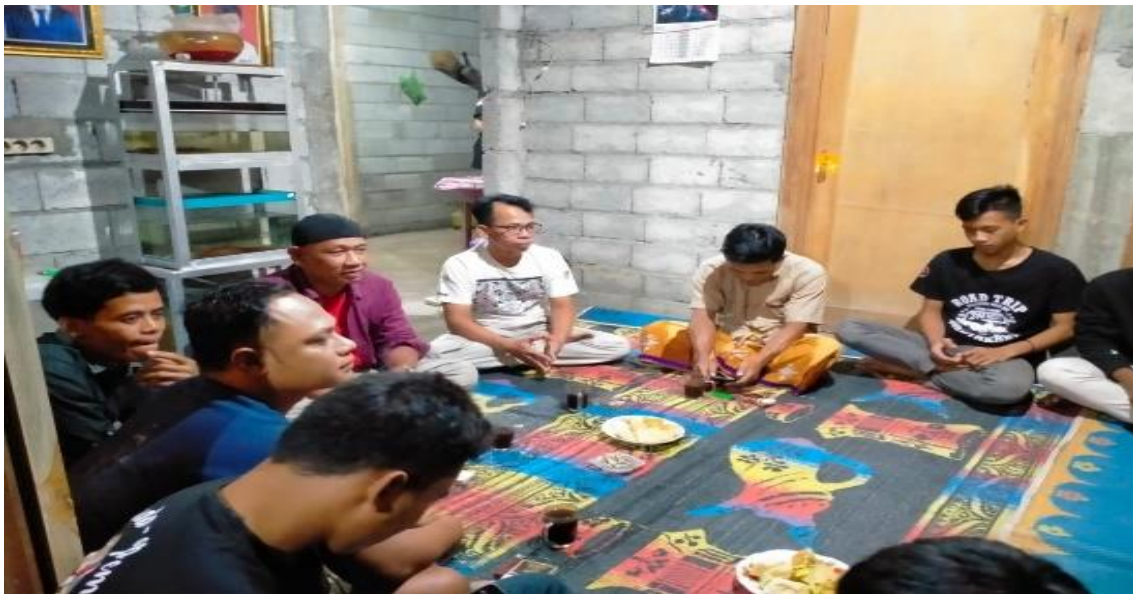
Figure 3. Socialization by Buddhist and Islamic Leaders to Youth on COVID-19 Awareness and Coping Strategies

the community's recognition of the ongoing potential threat of a " pagebluk ," a deadly disaster that is always looming.