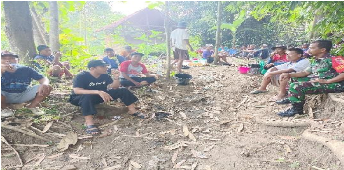
Figure 4. Village Leaders of Gelangkulon and Kamituwo in Sodong Hamlet Motivating Community Members in Response to the Covid-19 Pandemic