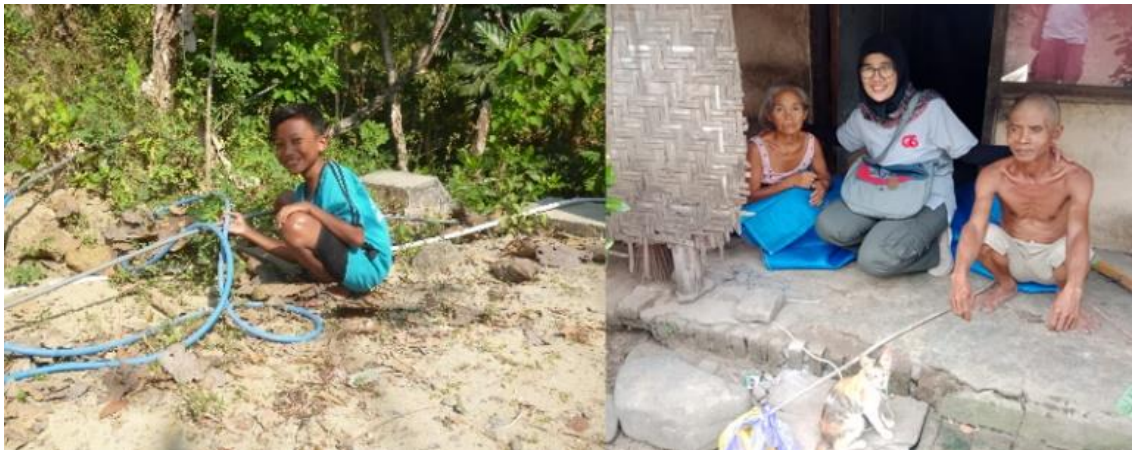
Figure 2. Residents Practicing Post-Activity Cleaning

Leaders, religious figures, and heads of families familiarized themselves and extended these practices to family members and the surrounding environment. They created situations and conditions to habituate community members to disaster mitigation, such as placing diyang in front of houses during celebrations and installing padasan on public hamlet roads and places of worship.