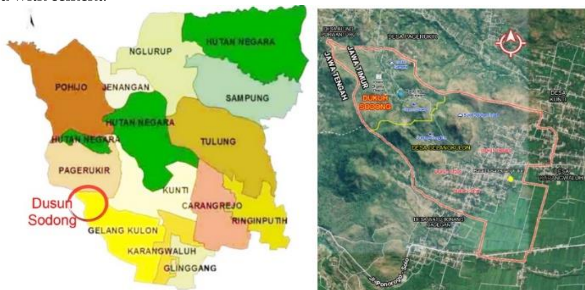
Figure 1. Map of Sodong Hamlet, Sampung District, Ponorogo Regency

Access to this hamlet is available through two village roads. The first route involves passing through Gelang Hamlet and Kroyo Hamlet, ascending via the slopes of Mount Bungkus. The second route traverses Pagerukir Village in Sampung District and serves as the primary alternative for entering and leaving Sodong Hamlet, featuring a more gradual slope and a road surfaced with cement.